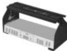
DVD mounts(VCR/DVD Mounts)01