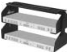
DVD mounts(VCR/DVD Mounts)02