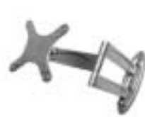
TV Wall Mounts01